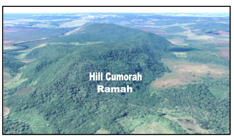
In Ether 14, it describes a horrific war in the land of Corihor and then to the final war near hill Ramah.

The book of Ether provides us with a fairly clear picture about the sequences and locations of the final war: